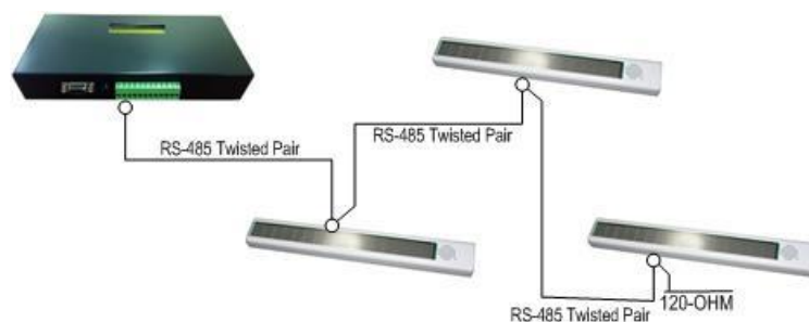
Multi-Drop RS-485 cabling and 120-ohm termination

Each run of cable between devices use a single twisted pair for A & B only, and must be terminated in a 120-ohm resistor at the end of the run length. Tee-off branches, or star-topologies can only be attempted with additional hardware data repeaters.